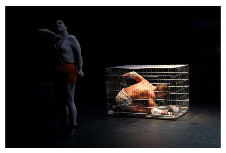
Figure 5. Isole Comprese Teatro. Fondamenti di Difettologia | Fundamentals of Defectology. Maschinenhaus Theater, Berlin, 2007.

Social theatre is a theatre of research, multifaceted, experimental and experiential. It questions the role of theatre and performance in terms of civil and social responsibility. It has a socio-political derivation and orientation and is not about a mere imitation of the reality or representation of characters. In the performance space, the performers mainly expose and play who they are in real life. The performances are often site-specific and not staged to amaze, entertain or amuse. They aim to probe the faults, flaws and fallacies in the social system. They address the prevailing mentality to reveal its superficiality, lack of thoroughness and crippled hypocrisies. In this sense, they function likewise an intruder who uses a crowbar to bust open a lock. They are radically inclusive. They bring together normally-abled performers who operate jointly with others indelibly marked by congenital or contracted diseases or signed by challenging life experiences. Its materia prima consists of all those people whose provenance belongs to the elsewhere called disadvantaged social categories: psychic patients, Down syndrome, wheelchair-bound, blind and deafmute people, inmates, former drug addicts, street sex workers, refugees forcibly displaced. (Figure 5 and 6)