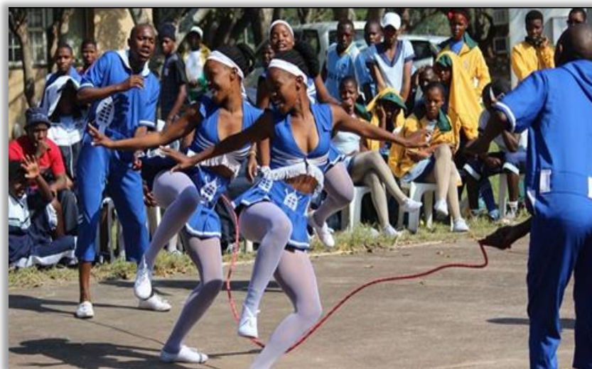
Figure 2: Players participating in the Indigenous Games Festival — Kgati Game (Department of Sports and Recreation, South Africa)

In Figure 2, a team comprising of girls and boys demonstrate the playing of the Kgati game. While the girls are skipping the rope, the boys are also playing a part in the movements of the rope. This is a game that clearly illustrates that both boys and games can play the game.