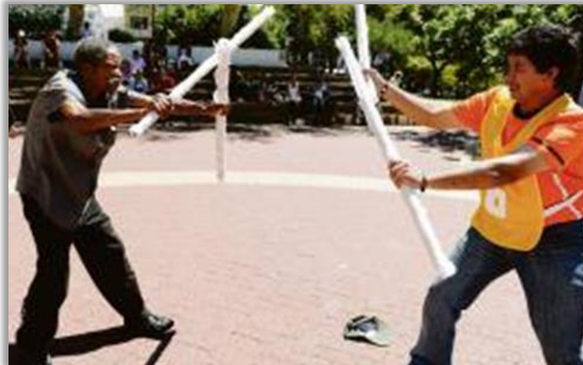
Figure 3: Players participating in the Indigenous Games Festival — Intonga Game

The Indigenous Games Festival are aimed at building a diverse society by embracing common national identity and celebrating a shared heritage. The annual Indigenous Games Festival has also assisted that the identified games — and other games not in the List that was launched — become the focus of research studies in Mathematics Education and other disciplines like Psychology of Education in South Africa, including other countries in Southern Africa.