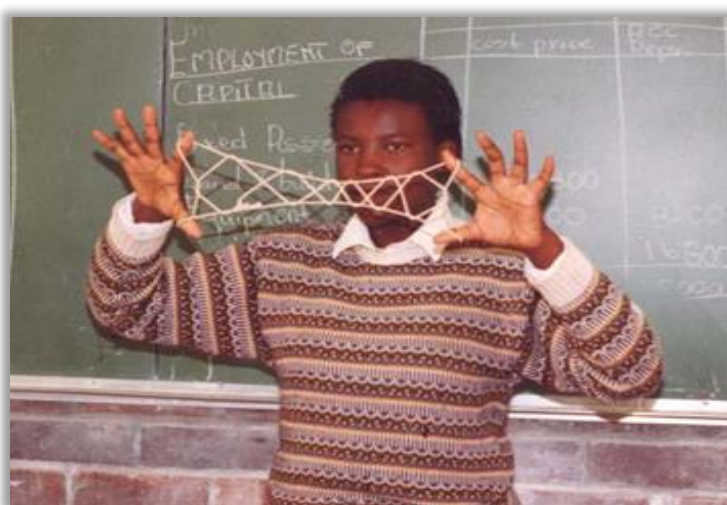
Figure 8: A demonstration of Figure Gate Six (Malepa a borataro) by a female Learner (MOSIMEGE, 2000, p. 207)

In figure 8, there is a demonstration of Figure Gate Six, which is a Malepa a borataro, performed by a female student.