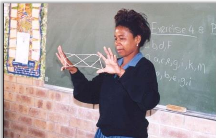
Figure 7: A demonstration of Figure Gate Two (Malepa a bobedi) by a female learner (MOSIMEGE, 2000, p. 201)

In figure 8, there is a demonstration of Figure Gate Six, which is a Malepa a borataro, performed by a female student.