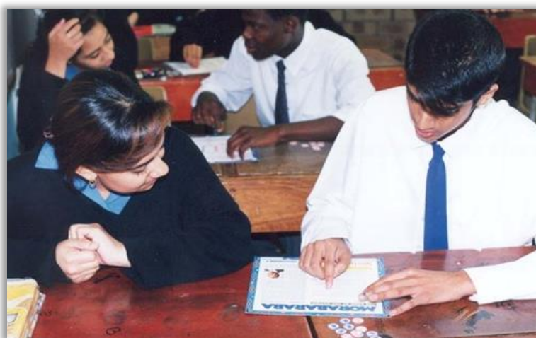
Figure 6: Learners referring to Morabaraba rules (MOSIMEGE, 2000, p. 235)

On a number of occasions, learners were video recorded studying the rules of the game before starting to play the game (Figure 6).